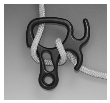
#3: More friction than #2